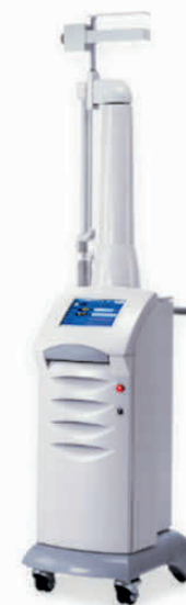
Lumenis UltraPulse Encore CO2 Laser

Cosmetic Laser Dermatology 9339 Genesee Ave #300 San Diego, CA 92121 858.657.1002 • CLDerm.com